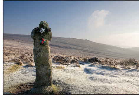
Bennetts Cross decorated with a Christmas wreath. This is one of Dartmoor’s best known and most accessible stone crosses and is thought to be at least 300 years old.