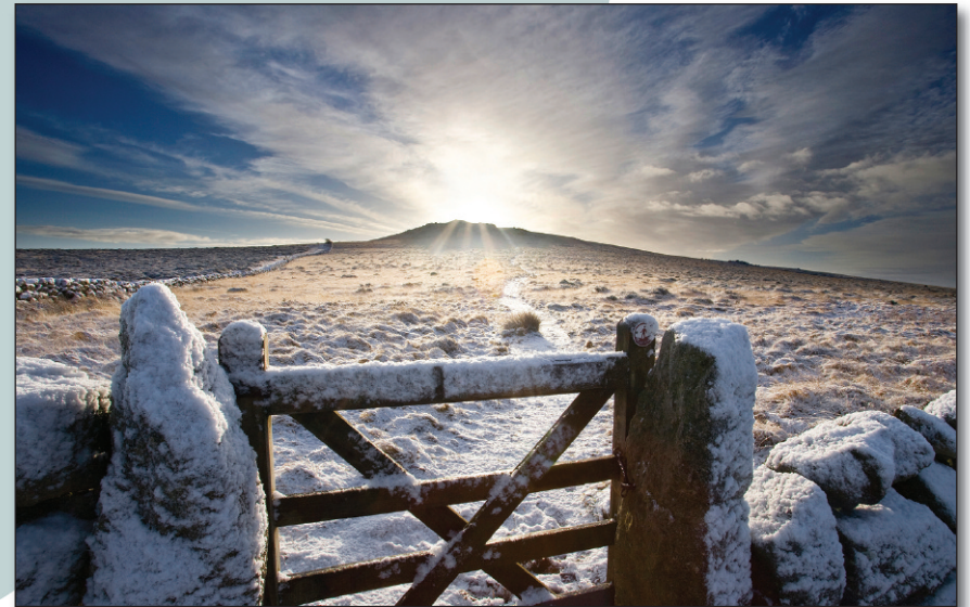
A fantastic morning sky casts a shadow behind Rippon Tor and illuminates the landscape. To have snow and the sun together is truly wonderful.