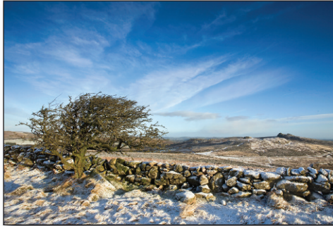
Wonderful quality of light can be enjoyed in winter, as with this view over Haytor vale.