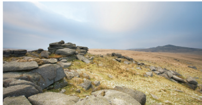
Above: A cold winter day at Ger Tor above Tony Cleve.