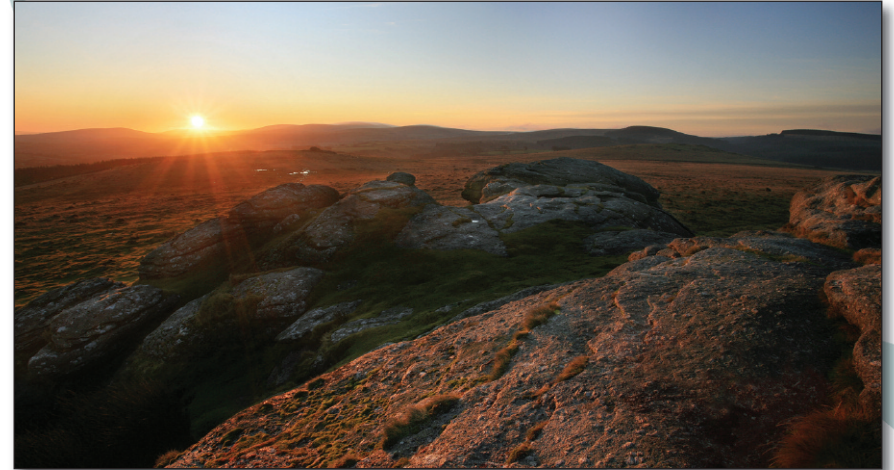
Light on the rocks at Kes Tor. There is a very short space of time as the sun just breaks the horizon when you get a magical light for just a couple of minutes. You have to leave home very early and be there ready and waiting.