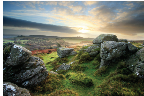
Right: From Honeybag Tor this sunrise initially started grey and overcast. Then, with amazing luck, the sun broke through and illuminated Haytor on the horizon.